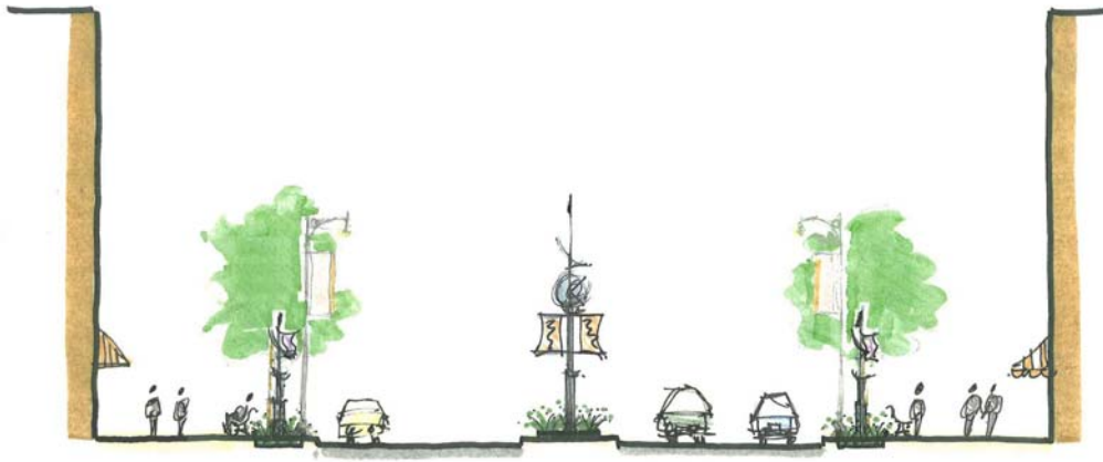
NORTH STREET - GATEWAY CROSS SECTION PITTSFIELD, MA